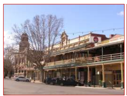
Figure 2.1: Images of Narrandera Town Centre