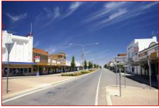
Figure 2.2: Images of Leeton Town Centre