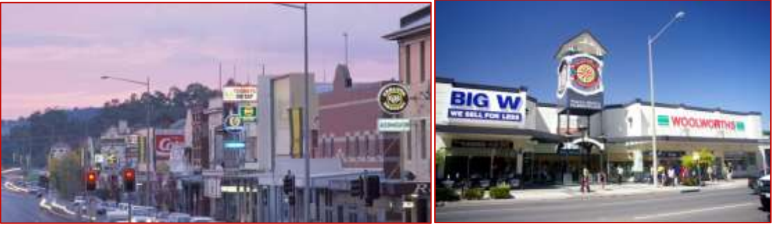
Figure 2.3: Images of Wagga Wagga Town Centre