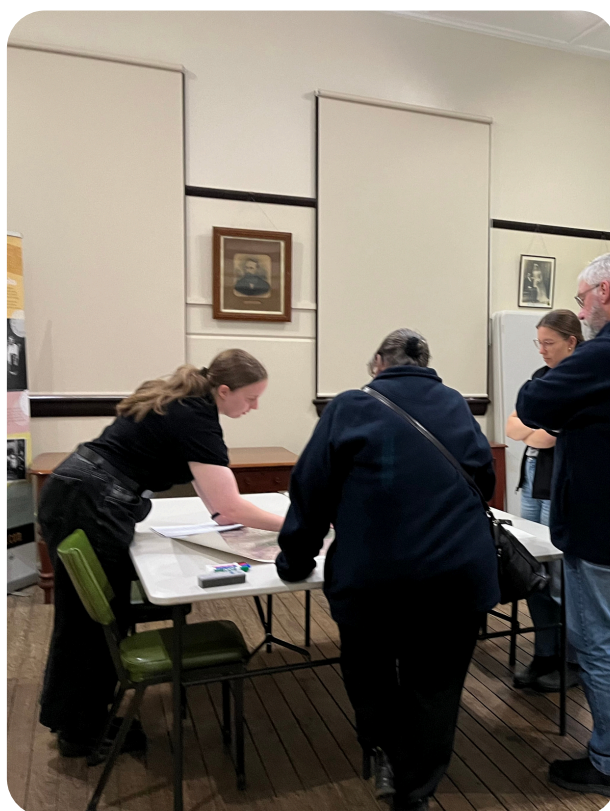
Community engagement in Spring Hill

As we continue to work through the prospect, we will continue to provide you with information on each of these key issues.